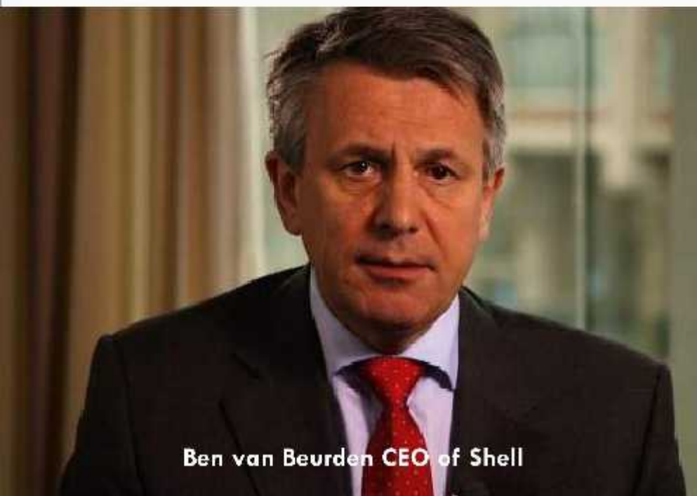
Ben van Beurden CEO of Shell

said his government cannot continue to loose 34m naira every month, hence he will use all tools in his power to help Shell.