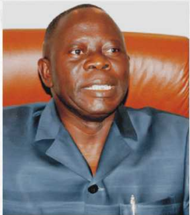
APC Chairman Adams Oshiomhole