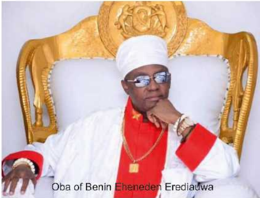
Oba of Benin Eheneden Erediauwa