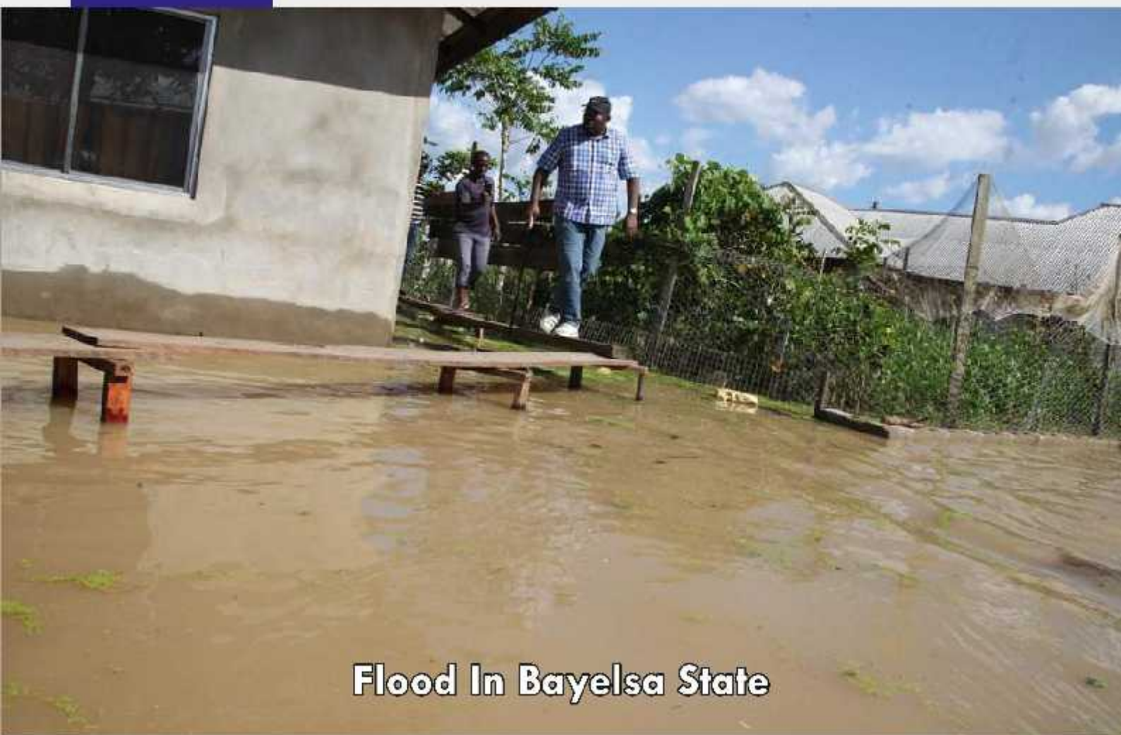
Flood In Bayelsa State