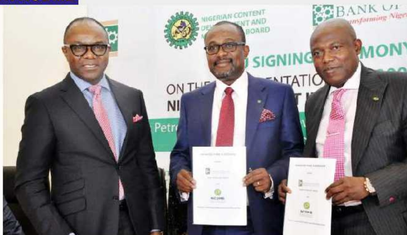
L-R: Dr. Emmanuel Ibe Kachikwu, Minister of State for Petroleum Resources; Engr. Simbi Wabote, Executive Secretary, NCDMB; Mr. Olukayode Pitau, Managing Director, Bank of Industry after the MOU signing ceremony on the implementation of the $200 million Nigerian Content intervention Fund in Abuja

which include DEMOCRATIZE access to credit for eligible Nigerian oil and Gas service companies and community contractors to single digits loans under the $200m Nigerian Content Intervention Fund.