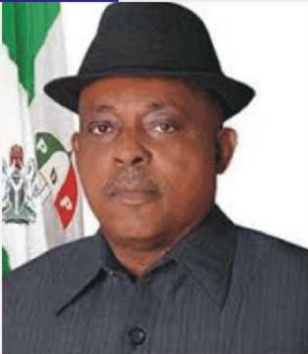
PDP Chairman Uche Secondus