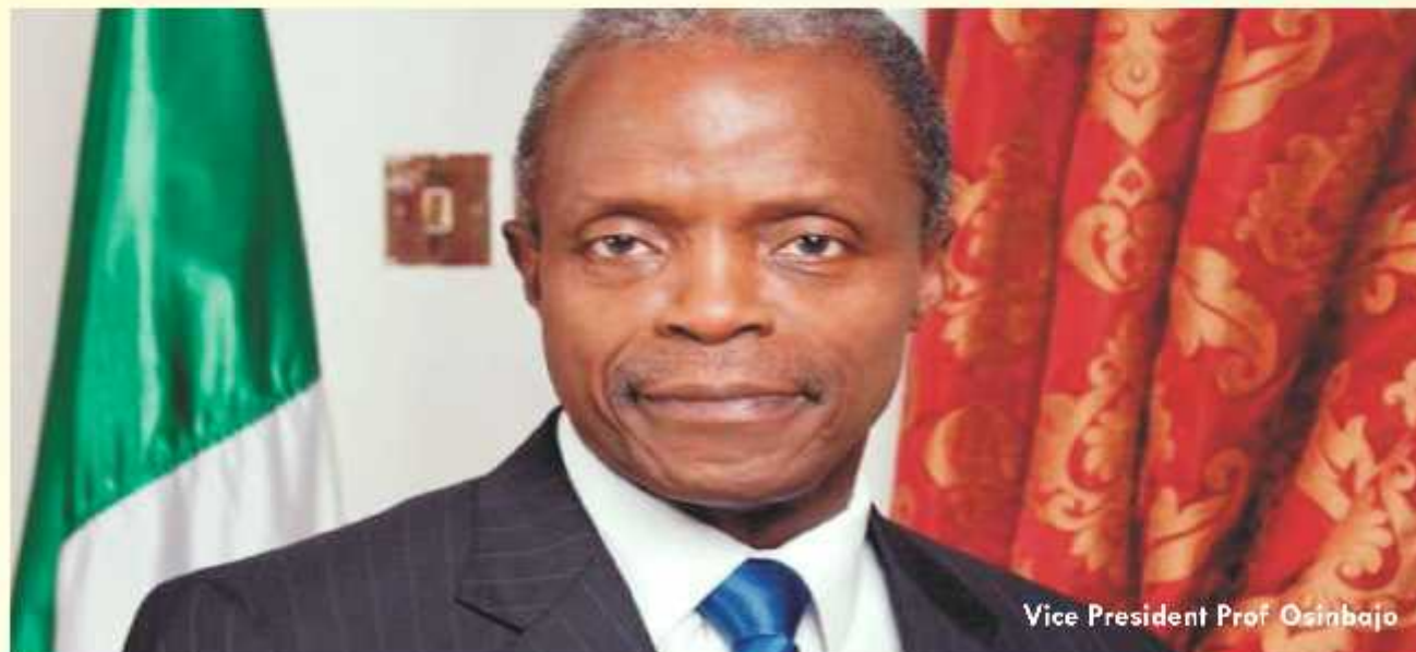
Vice President Prof Osinbajo

T he Vice President Professor Yemi Osinbajo said oil revenue accruable to Nigeria under successive administrations between 1990 and 2014 is about one trillion dollars.