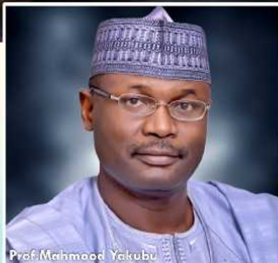
Prof. Mahmood Yakubu