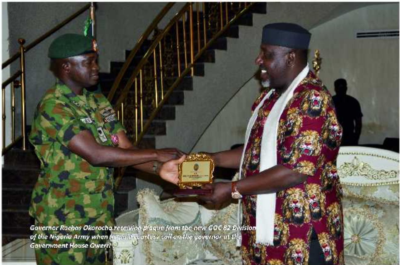
Governor Rochas Okorocha receiving plaque from the new GOC 82 Division of the Nigeria Army when he paid courtesy call on the governor at the Government House Owerri.

must be on deck and ensure that the nation's democracy is saved. Owelle told the GOC "You have been posted at a critical time in the period of electioneering. We request that the Military should do the needful to ensure free and fair election. I have no doubt that the army will do the needful by ensuring free Conduct of these elections".