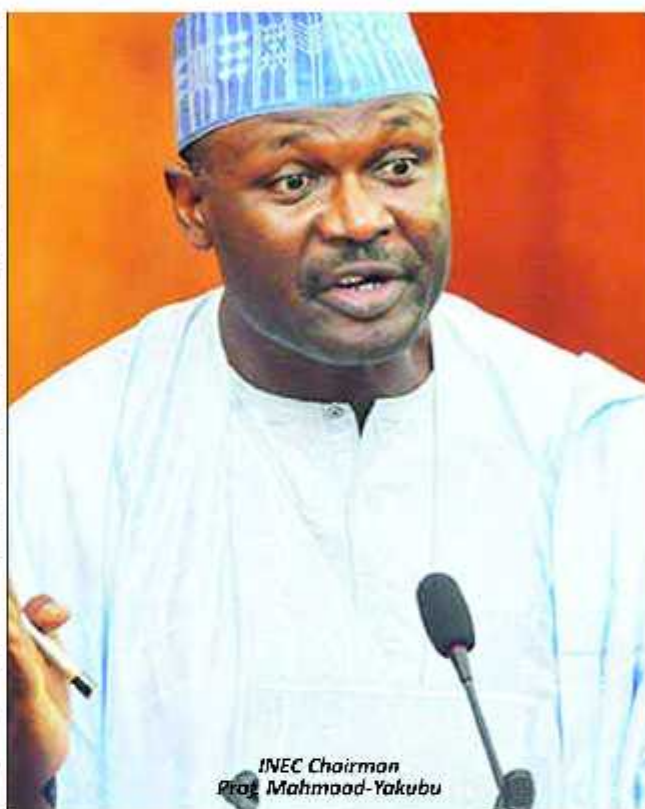
INEC Chairman Prof. Mahmood-Yakubu

"Has it ever occurred to Rivers people that the ultimate beneficiary of the crisis in Rivers APC is Wike. Now who initiated the crisis? Was it Wike who said that the meeting all