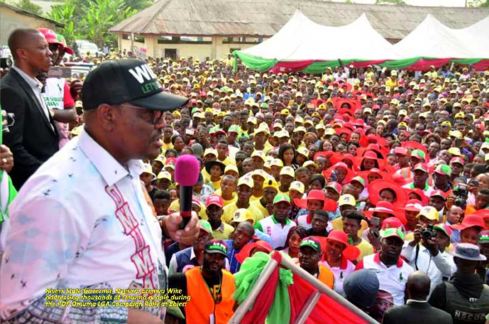
Rivers State Governor, Nyesom Ezenwo Wike addressing thousands of Omuma people during the PDP Omuma LGA Campaign Rally at Eberri