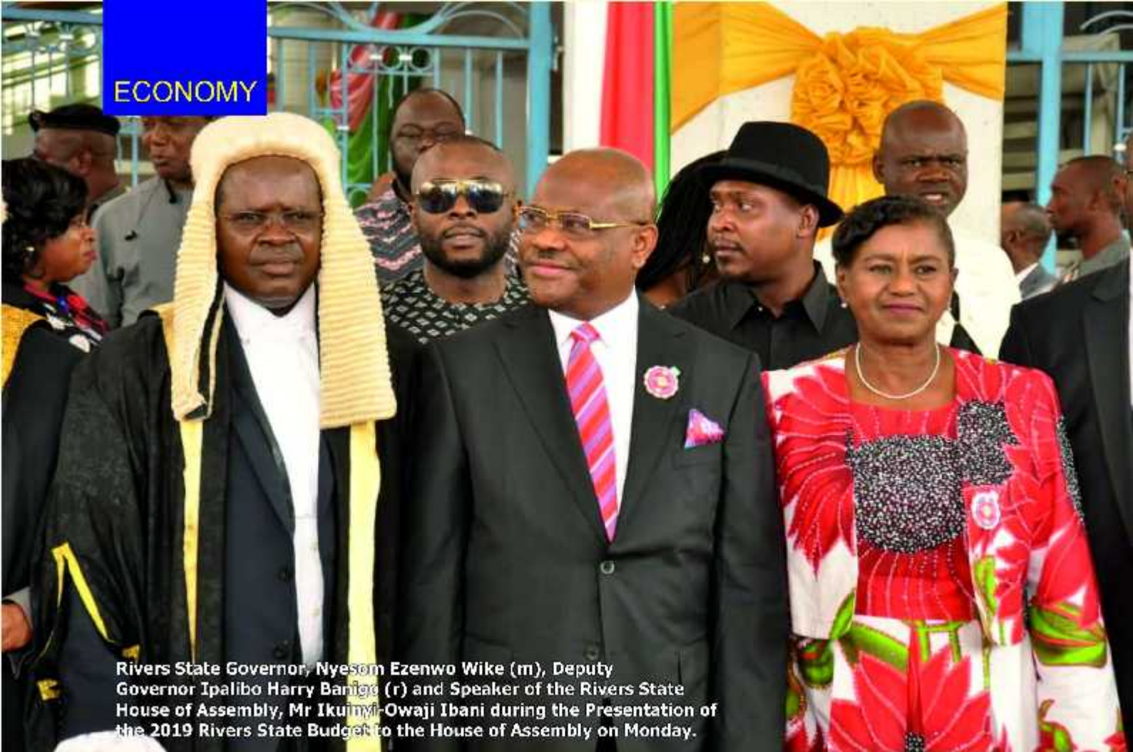
Rivers State Governor, Nyesom Ezenwo Wike (m), Deputy Governor Ipalibo Harry Banigo (r) and Speaker of the Rivers State House of Assembly, Mr Ikuimyi-Owaji Ibani during the Presentation of the 2019 Rivers State Budget to the House of Assembly on Monday.

The sectoral allocation of the capital budget is as follows: (Proposed) Administration Sector; N17, 820,704,443.79 ,Economic Sector: N99, 053,565,640.20 ; Law and Justice Sector; N4,350,000,000.00; Social Sector; N127, 292,200,000.00 and ; Special Heads, N127, 347,500,000.00; Loan Repayments , N24, 425,000,000.00.