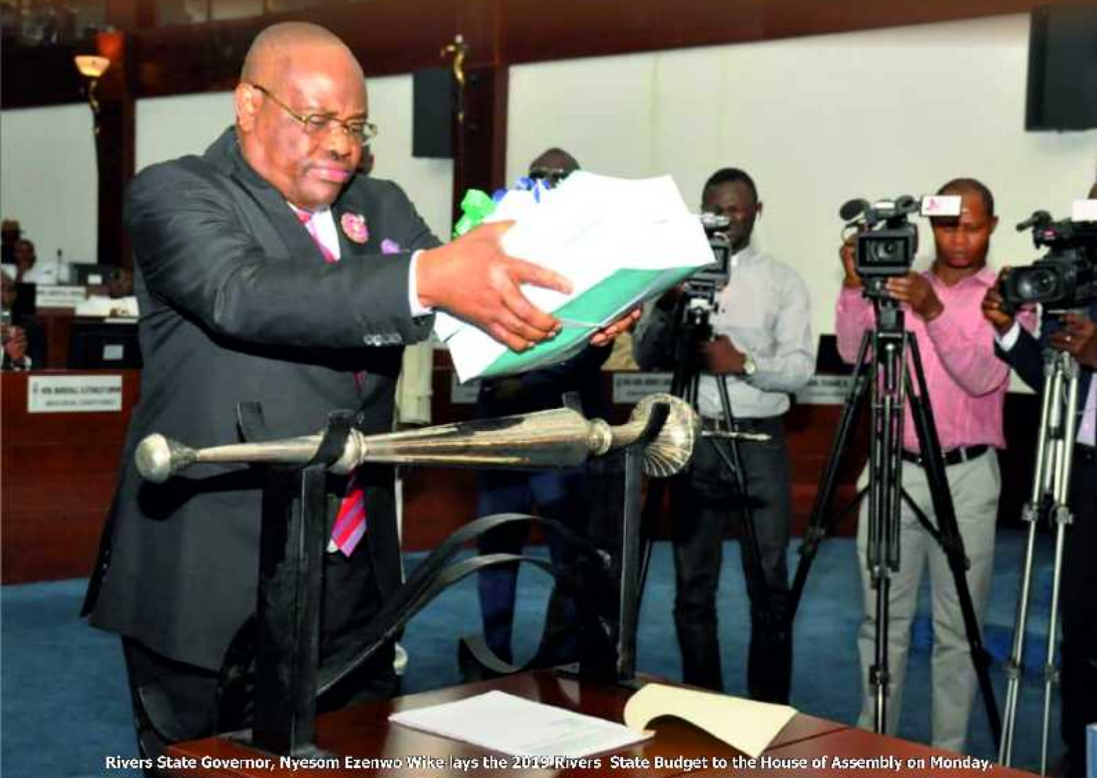
Rivers State Governor, Nyesom Ezenwo Wike lays the 2019 Rivers State Budget to the House of Assembly on Monday.

R ivers State Governor, Nyesom Ezenwo Wike 2019 presented the 2019 Appropriation Bill of N480billion to the State House of Assembly for consideration and approval.